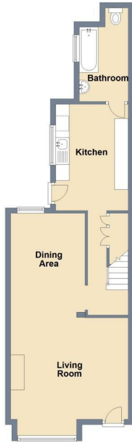
Ground Floor Approx. 50.8 sq. metres (546.3 sq. feet)